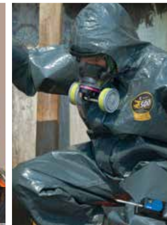
Zytron® 500 gas-tight styles features new AntiFog Visor. (note: old vs. new comparison shows Frontline® garment)