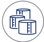
Bulk storage plants for gasoline or other volatile