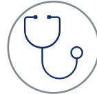
Health care facilities