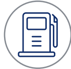
Gasoline dispensing and service stations