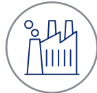
Paint-finishing process plants