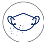
Facilities where excessive combustible dusts may be present