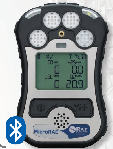
MicroRAE talks via Bluetooth® Low Energy (BLE) technology to the phone

Already have a private Wi-Fi or mesh network? Use BLE and Safety Communicator to ensure continuous wireless monitoring even when a worker is out of range. With the MicroRAE and real-time monitoring software, you never have to worry about blind spots. You always have visibility on your workers' location and gas status.