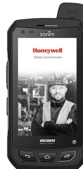
Phone talks over cellular network to the same host PC as the other detectors