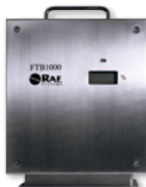
RAE PowerPak External Battery